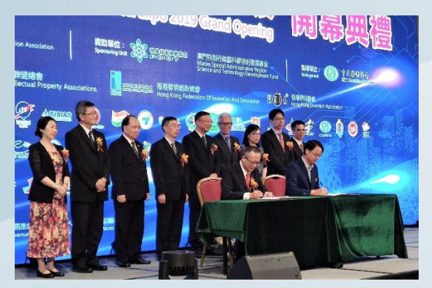
The cooperation Agreement Signing Ceremony between the Huafa 7 Intellectual Property Right National Intellectual Property Operation Platform and MIIA.

The ribbon-cutting ceremony was attended by leaders of the Liaison Office of the Central Committee of the Communist Party of Macao, officials and representatives of relevant departments of the Macao SAR government, social celebrities, guests from both sides of the Taiwan Straits and foreign countries