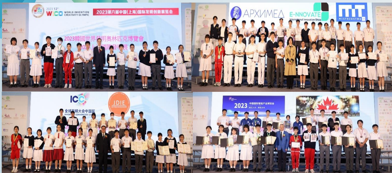
Group Photos of Participants in Participating International Contests