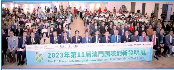
出席「2023年第十一屆澳門國際創新發明展」頒獎典禮嘉賓及與會者合照。